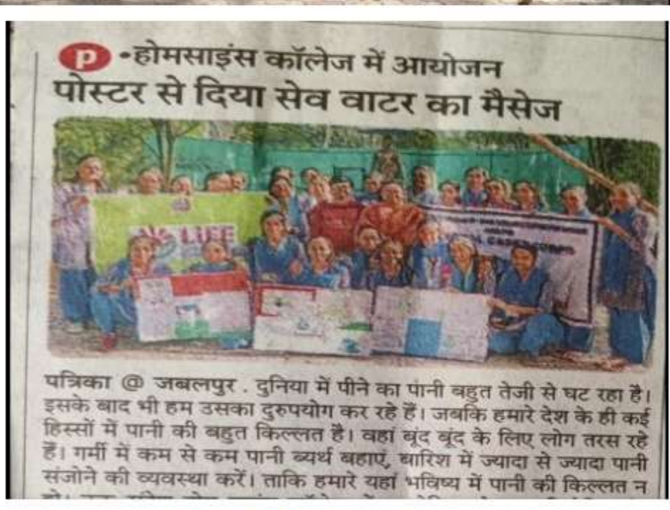
Water Conservation Awareness 30/05/2023